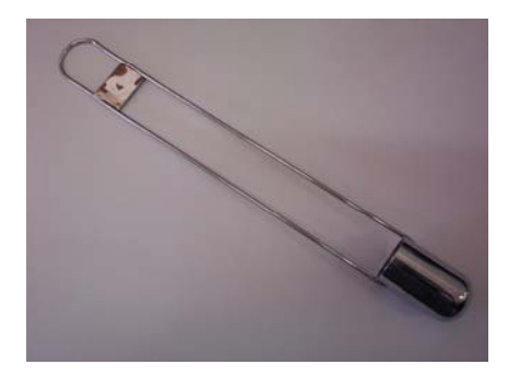
Figure 2.2 Viscosity cup No. 4.

2.1.2.4 Thermometer was used together with viscosity cup to measure temperature during viscosity measurement and preparation of static headspace (E-mil P10116, Lloyd's Register Quality Company, UK).