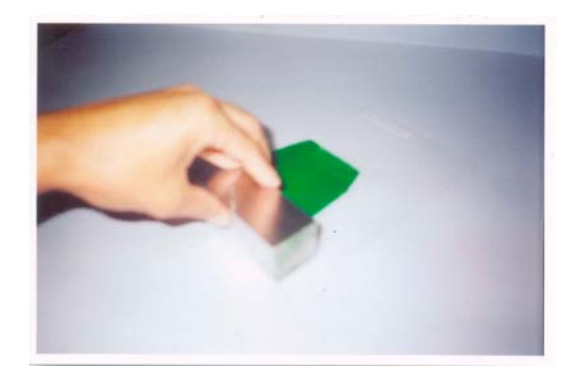
Figure 2.4 Coating the paint onto plastic by film applicator.

The plastic (HDPE plastic) was cut to obtain the size of 100 x 200 mm and put on a smooth glass plate before coating the film. Then, the sample was stirred until homogeneously blended. After that the sample was dropped onto plastic flame (approximately 15-20 drops) without any air bubbles. The film was coated on plastic by the film applicator and left to obtain a dry film. The sample was then taken to measure the adhesion.