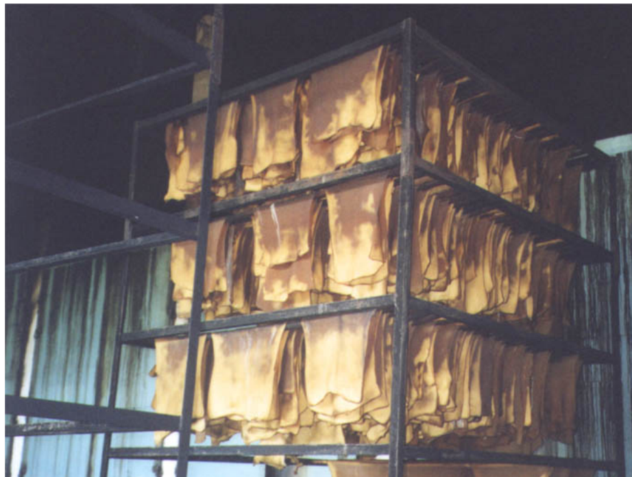
Figure 1.3 Non-uniform RSS on a cart.

rubber sheets. Results from investigation show that the non-uniform and low efficiency problems occurred from the uneven distribution of the hot gas from the ducts and high heat loss through the draft tube. This results from geometry of rubber smoking room which is not suitable, particularly, at the gas inlet and at the outlet of the room. The size, position and number of the gas supply ducts and the ventilating lids are not well designed. The rubber smoking room is a crucial component in the rubber smoking process. Improvement of the temperature and velocity distributions in the rubber smoking room is then necessary to increase uniformity of rubber sheet and efficiency of fuel usage.