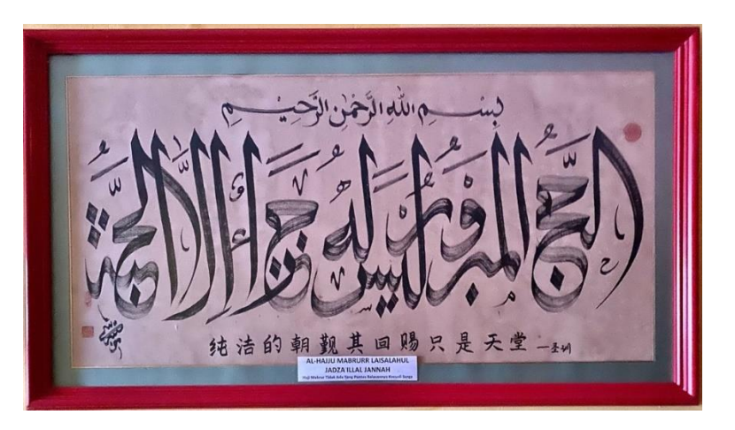
Figure 4.8 Religious Symbols of Lautze Mosque Jakarta

The intention of this calligraphy is to give more understanding to all overseas Chinese and othe Mualaf about this hadith or Islamic symbols or mandatory verse in Al-Quran and also can pronounce it properly.