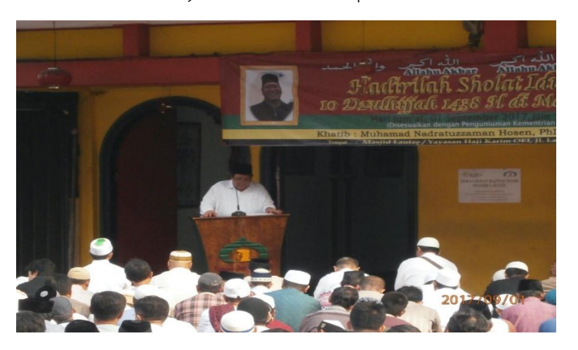
Figure 4.14 Eid Al-Adha Prayer in Lautze Mosque Jakarta

when commemorating Islamic festivals. There are two sorts of Muslim celebrations: Eid Al-Adha and Eid Al-Fitr, which are observed on 1 Shawwal or after Ramadan. All local people of Indonesia, overseas Chinese Muslims, and other races usually do these prayers together yearly.