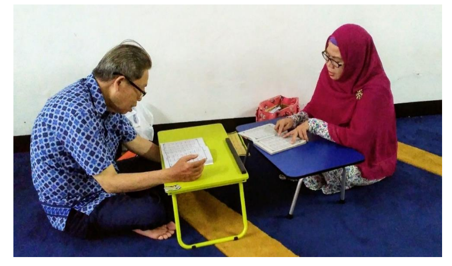
Figure 4.20 The Overseas Chinese Learn Islamic Education

As shown in Figure 4.20, the overseas Chinese learn Islamic education from an expert in the Islamic religion. The overseas Chinese usually go to the Lautze Mosque on Sunday to learn how to read the Islamic Bible (Al-Quran) and Iqra (Fundamental Islamic Bible). Iqro is a textbook used in Indonesia and Malaysia for learning Arabic letters and pronunciation. It was initially published in the early 1990s, authored by As'ad Humam and a team called "Team Tadarus AMM." Additionally, the overseas Chinese learn how to pray in the Islamic religion and the process of doing Islamic rituals. The Lautze Mosque in Jakarta and Bandung facilitates their learning about Islam.