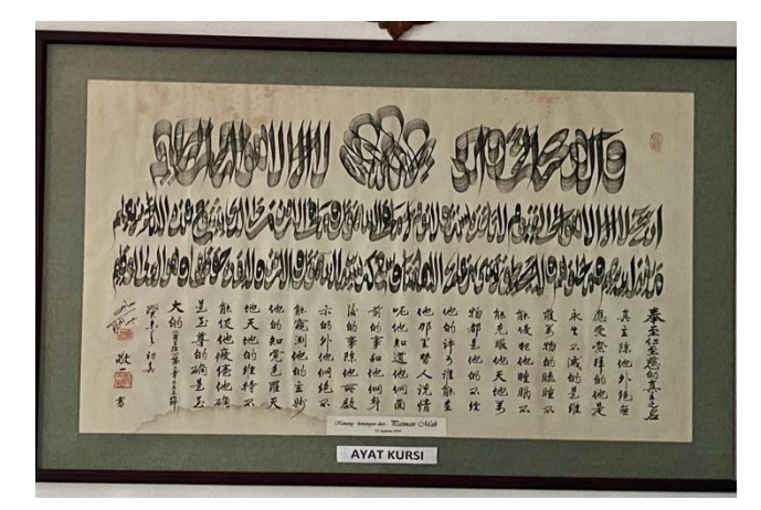
Figure 4.7 Religious Symbols of Lautze Mosque Jakarta

As shown in Figure 4.7, the researcher took the calligraphy Islamic symbol, one of the verses in the Al-Quran named Ayatul Kursi. The researcher took that at Lautze Mosque in Jakarta, which contains two languages, Arabian and Chinese. The verse says