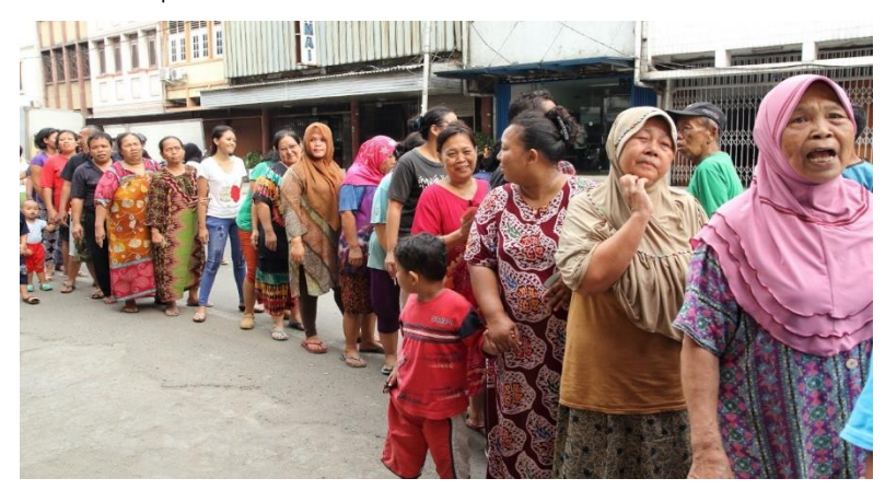
Figure 4.15 The Distribution of Meat of Qurban (Islamic Ritual Sacrifice) in Lautze Mosque Jakarta

Based on Figure 4.14, we can see that the people at the Lautze Mosque in Jakarta do the Sholat Eid Al-Adha prayer. In the Islamic faith, Eid prayers, known as Salat Al-Eid, are holy festival prayers. In Arabic, the term "Eid" literally means "festival" or "feast," and it is a time when Muslims gather with family and the greater Muslim community to celebrate. The Eid prayer is a two-cycle sunnah prayer that Muslims do when commemorating Islamic festivals. There are two sorts of Muslim celebrations: Eid Al-Adha and Eid Al-Fitr, which are observed on the first of Shawwal or after Ramadan. All of the local people of Indonesia, overseas Chinese Muslims, and other races usually do these prayers here together every year.