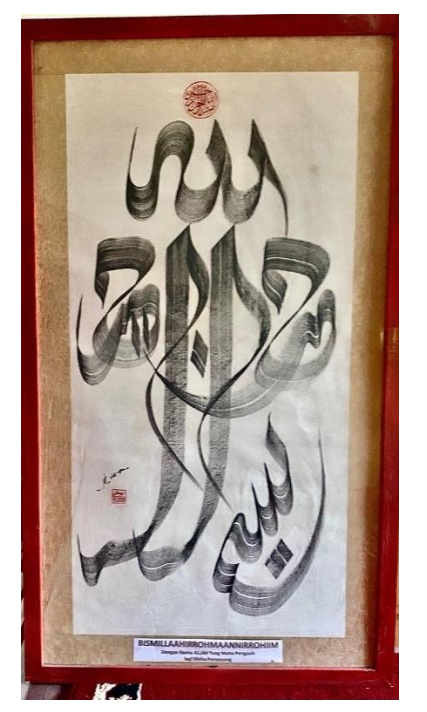
Figure 4.11 Religious Symbols of Lautze Mosque 2 Bandung

As we can see in Figure 4.10, the researcher took calligraphy Islamic symbols, which the researcher took at Lautze Mosque Jakarta, which contains three languages: Arabic, Indonesian, and Chinese. The verse says, "Allahumma Ya Muqollibal Quluub Tsabit Qolbi Aladdiinik," which means "O Turner of Hearts, keep my heart firm on Your religion." this is one of the mandatory prayers, especially for Mualaf. It is a prayer to repel confusion and give peace to the heart. This calligraphy intends to give more understanding to all overseas Chinese and other Mualaf about Islamic symbols and help them pronounce them correctly.