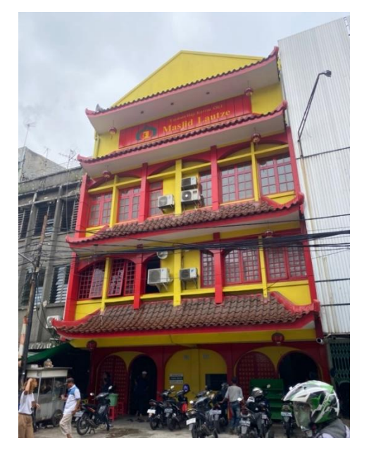
Figure 4.1 Lautze Mosque in Jakarta

Furthermore, the Lautze Mosque 2 Bandung is located on Tamblong Street, in the heart of Bandung, with the exact address "Jl. Tamblong No. 27, Braga, Kec. Sumur Bandung, Kota Bandung, Jawa Barat 40111." Additionally, the researcher will provide two different perspectives and knowledge from the head of the mosque regarding the brief history of Lautze Mosques in Jakarta and Bandung.