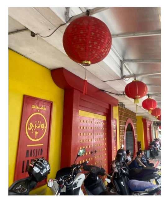
Figure 4.2 Lautze Mosque in Bandung

Furthermore, the Lautze Mosque 2 Bandung is located on Tamblong Street, in the heart of Bandung, with the exact address "Jl. Tamblong No. 27, Braga, Kec. Sumur Bandung, Kota Bandung, Jawa Barat 40111." Additionally, the researcher will provide two different perspectives and knowledge from the head of the mosque regarding the brief history of Lautze Mosques in Jakarta and Bandung.