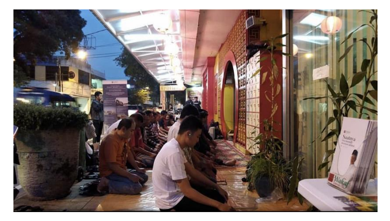
Figure 4.18Tarawih Prayer in Lautze Mosque 2 Bandung

Based on Figure 4.17, we can see that the people at the Lautze Mosque 2 Bandung do the Sholat Eid Al-Fitr and Eid Al-Adha Prayer out of the mosque but still near the area of the Lautze Mosque 2 Bandung because the head of Lautze Mosque 2 Bandung said the mosque could not accommodate too many people to worship in this mosque. In the Islamic faith, Eid prayers, known as Salat Al-Eid, are holy festival prayers. In Arabic, the term "Eid" literally means "festival" or "feast," and it is a time when Muslims gather with family and the greater Muslim community to celebrate. The Eid prayer is a two-cycle sunnah prayer that Muslims do when commemorating Islamic festivals. There are two sorts of Muslim celebrations: Eid Al-Adha and Eid Al-Fitr, which are observed on 1 Shawwal or after Ramadan. All local Indonesians, overseas Chinese Muslims, and people of other races usually do these prayers together yearly.