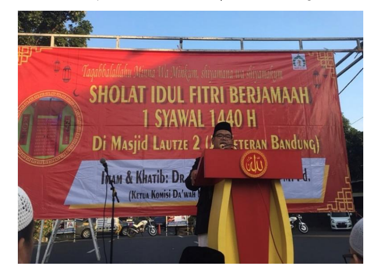
Figure 4.17 Eid Al-Fitr Prayer in Lautze Mosque 2 Bandung

Based on Figure 4.17, we can see that the people at the Lautze Mosque 2 Bandung do the Sholat Eid Al-Fitr and Eid Al-Adha Prayer out of the mosque but still near the area of the Lautze Mosque 2 Bandung because the head of Lautze Mosque 2 Bandung said the mosque could not accommodate too many people to worship in this mosque. In the Islamic faith, Eid prayers, known as Salat Al-Eid, are holy festival prayers. In Arabic, the term "Eid" literally means "festival" or "feast," and it is a time when Muslims gather with family and the greater Muslim community to celebrate. The Eid prayer is a two-cycle sunnah prayer that Muslims do when commemorating Islamic festivals. There are two sorts of Muslim celebrations: Eid Al-Adha and Eid Al-Fitr, which are observed on 1 Shawwal or after Ramadan. All local Indonesians, overseas Chinese Muslims, and people of other races usually do these prayers together yearly.