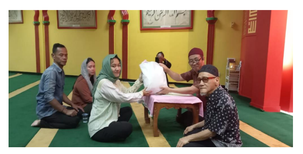
Figure 4.5 The Process of Religious Conversion in Lautze Mosque Jakarta

Most respondents have similar answers, such as the Lautze Mosque near their home. However, R3, a respondent from Lautze Mosque Jakarta, stated that this mosque is filled with people who behave positively, they are not pushy but tolerantly accepting of every ethnicity and race, so there is very little discrimination. Moreover, the staff and administrators of the mosque are very fostering in converting religions and also teach religious matters correctly and in detail. R1, a Lautze Mosque 2 Bandung respondent, said the mosque is strategically located in the middle of the city center and on the side of a major road. In addition, the R4 from Lautze Mosque 2 Bandung said that after he came by the mosque and looked around, he seemed to find more detailed information about Lautze Mosque 2 Bandung on social media and the Internet, and he saw many positive reviews and comments. In a nutshell, each respondent has a significance reason why they chose this mosque as their religious conversion.