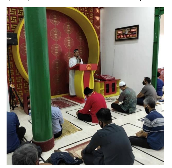
Figure 4.16 Friday Prayers Activities in Lautze Mosque 2 Bandung

Figure 4.15 shows that the people were queuing at the Lautze Mosque in Jakarta to distribute the meat of Qurban (Islamic ritual sacrifice on Eid Al-Adha). Qurban comes from the Arabic word, "Qurban" which means close (فربان). Sacrifice in Islam is also called al-udhhiyyah and adh-dhahiyyah, which means slaughtered animals, such as camels, cows (buffaloes), and goats on Eid al-Adha and tasyriq days as a form of taqarrub, or getting closer to Allah SWT. It is customary for those who sacrifice to eat the meat of their sacrifice, give it to their relatives, and give it to those who need it. Sacrificial meat is not allowed to be sold, nor is the skin. Furthermore, they may not give to butchers as wages.