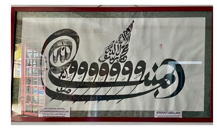
Figure 4.6 Religious Symbols of Lautze Mosque Jakarta

namely Islamic calligraphy, which we provide in Mandarin and translations in Arabic and Indonesian. Furthermore, overseas Chinese can learn how to speak or pronounce, which maybe Chinese people confused with Arabic, but since we modified it by mixing Mandarin with the Arabic translation, ethnic Chinese are better able to understand Islamic meanings and verses. Moreover, they can learn how to write verses of the Al-Quran in Arabic by looking at the religious symbols in this Lautze mosque. However, the Lautze Mosque 2 Bandung only has one Islamic calligraphy, which is still insufficient. However, the head of the Lautze Mosque 2 Bandung plans to put more religious symbols and Islam calligraphy at the mosque. The researcher took pictures of the religious symbols and Islam calligraphy at both mosques.