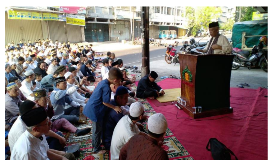
Figure 4.13 Eid Al-Fitr Prayer in Lautze Mosque Jakarta

Based on Figure 4.13, we can see that the people at the Lautze Mosque in Jakarta do the Sholat Eid Al-Fitr prayer. In the Islamic faith, Eid prayers, known as Salat Al-Eid, are holy festival prayers. In Arabic, the term "Eid" literally means "festival" or "feast," and it is a time when Muslims gather with family and the greater Muslim community to celebrate. The Eid prayer is a two-cycle sunnah prayer that Muslims do