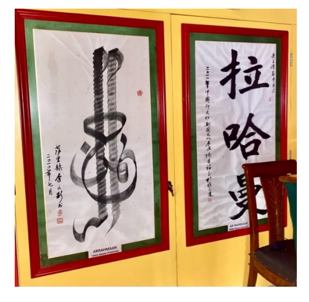
Figure 4.9 Religious Symbols of Lautze Mosque Jakarta

As we can see in Figure 4.9, the researcher took calligraphy Islamic symbols, which the researcher took at Lautze Mosque Jakarta, which contains three languages: Arabic, Indonesian, and Chinese. The verse says "Arrahman," which means "the most loving." This calligraphy intends to give more understanding to all overseas Chinese and other Mualaf about Islamic symbols and help them pronounce them correctly.