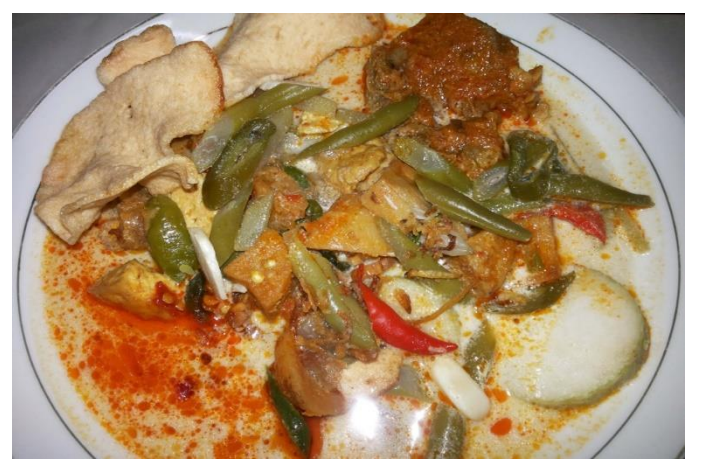
Figure 4.23 Lontong Cap Gomeh (Indonesian-Chinese Ethnic Food)

food to their neighbors. Furthermore, several ethnic Chinese converts bring "Lontong Cap Go Meh" and other halal Chinese food. He saw and felt this cultural hybridity and double identity phenomenon.