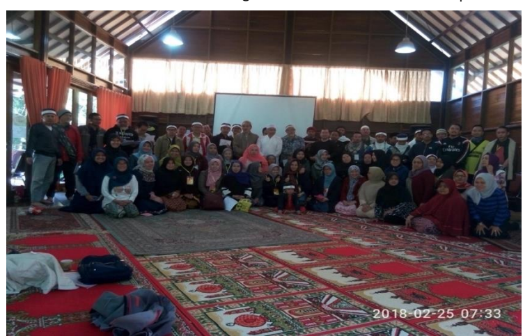
Figure 4.19 Short-term Islamic Boarding School in Lautze Mosque Jakarta

derived from an Arabic word associated with rest. Tarawih prayers are special Muslim prayers that involve reading extensive passages of the Quran and completing several rakahs. They are only found in the Sunni branch of Islam. Alternatively, this ritual is known as the Ramadan nighttime prayer. Tarawih prayer is a form of sunnah worship with sunnah muakkad as its law. The tarawih prayer is generally conducted after the Isya prayer in congregation in the mosque during Ramadan. You can, however, perform this tarawih prayer service at home. Taraweeh prayer hour begins after evening prayer and lasts till before daybreak. This prayer can be done at the beginning of time or in the middle of the night after sleeping. All local Indonesians, overseas Chinese Muslims, and people of other races usually do the Teraweeh prayers together every night, starting at 7 p.m. on the first night of Ramadhan month.