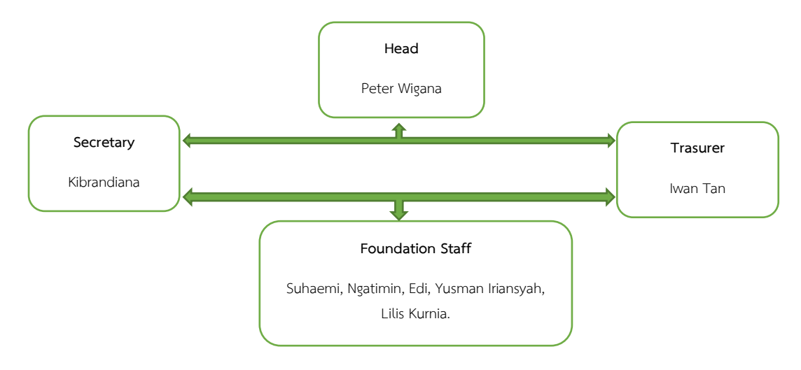
Figure 2.1 Lautze Mosque Administrative Staff

The Management Structure of the Haji Karim Oei Foundation for the period 2016 – now: