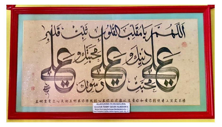
Figure 4.10 Religious Symbols of Lautze Mosque Jakarta

As we can see in Figure 4.10, the researcher took calligraphy Islamic symbols, which the researcher took at Lautze Mosque Jakarta, which contains three languages: Arabic, Indonesian, and Chinese. The verse says, "Allahumma Ya Muqollibal Quluub Tsabit Qolbi Aladdiinik," which means "O Turner of Hearts, keep my heart firm on Your religion." this is one of the mandatory prayers, especially for Mualaf. It is a prayer to repel confusion and give peace to the heart. This calligraphy intends to give more understanding to all overseas Chinese and other Mualaf about Islamic symbols and help them pronounce them correctly.