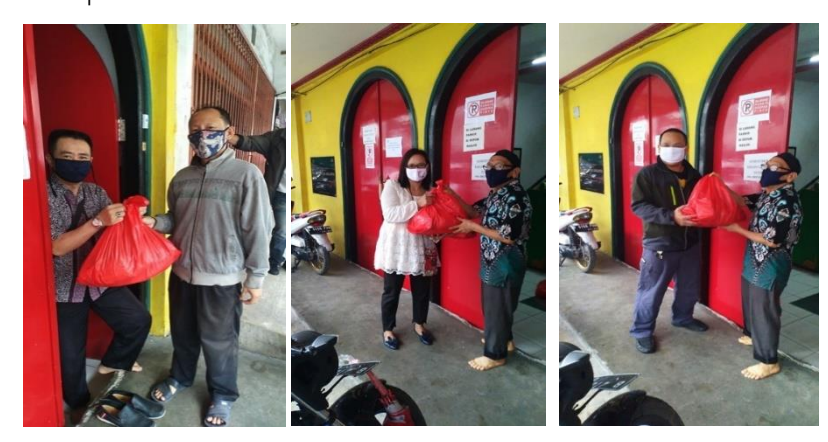
Figure 4.22 The Distribution of Groceries Stuff in the Month of Ramadan in Lautze Mosque Jakarta

to the overseas Chinese and Peranakan Chinese who need it. This is one of the Islam traditions mixed with Indonesian tradition every Ramadhan month once a year.