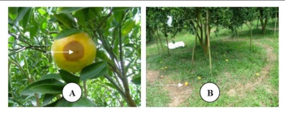
Figure 5. A) Damage symptoms caused by the FPMs in citrus (arrow). B) Damaged fruits fall down under the bush (arrow).