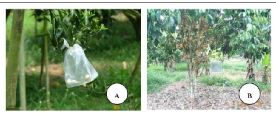
Figure 1. Napthalene in plastic bag hanging on citrus shoot (A) and longkong plantation (B).