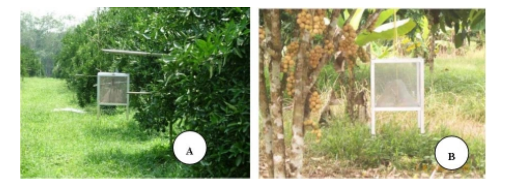
Figure 2. Insect cages for trapping the FPMs in citrus (A) and in longkong (B).

FPM species were recorded, and their diversity was calculated with Simpson's index (Ds):