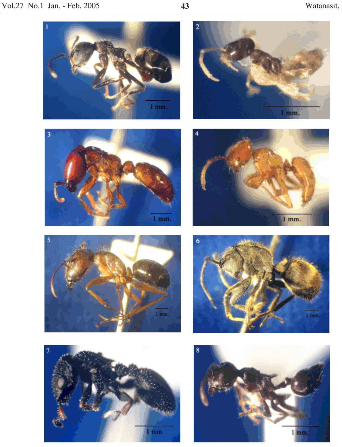
Figure 2. Some ant species were collected from reserve area of Prince of Songkla University.