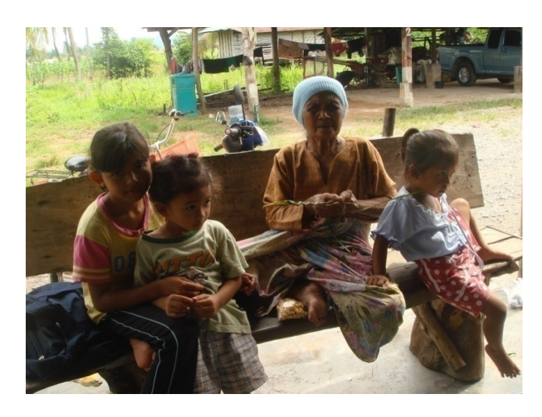
Figure 5. An elderly woman taking care of children

to have their own family. Even though their children moved out from home they all maintained good relationships with their parents. Some of them decided to build their new houses near their parents' houses. The houses are not fenced, so the residents can easily visit each other. There is a balcony or a large forecourt in every house which is used for meeting family members and relatives when they are free from work and this area is also a playground for children. Duringthe vacations, the elderly people look after their grandchildren. Most parents of these grandchildren work as rubber tappers, while some work in town.