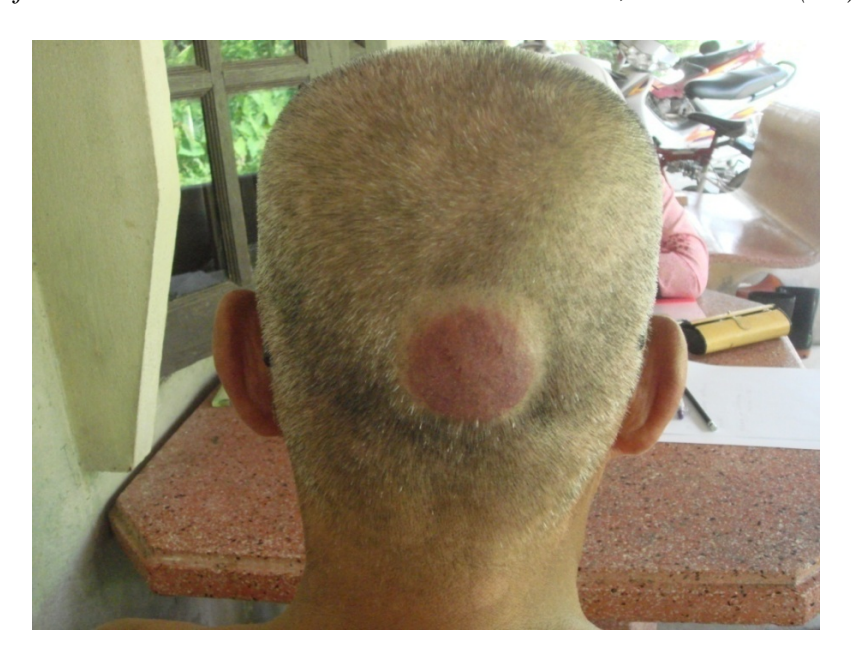
Figure 12. Removing blood from head by folk healers

"At the beginning of blood drainage method, the folk healer will read 'Al-Quran' before the treatment. There are four steps of blood drainage: the folk healer will measure the diameter of skin head where the method will be done by using a bottlenose. Then he will shave the hair as a circle shape in the same size of the bottlenose at an area where the blood will be drained; the bottle is turned over at the drainage area and then a piece of paper is burnt and put inside the bottle for few minutes until the scalp is swollen; the swollen scalp is slit with a razor; and the wound is covered with the bottle again. Then, a piece of paper is again burnt and put in the bottle. Three tablespoons of blood will be drained from the wound. Previously, the folk healer who did this method was in Moo 4, but he has now passed away. Hence, the folk healer who can do this method is in Moo 5, Ban Kuan." (K6)