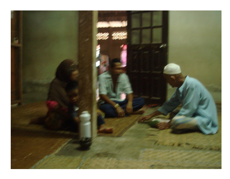
Figure 4. Folk healers' treatment in the community