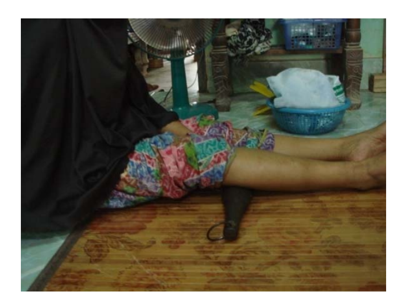
Figure 15. Hot compress with stone