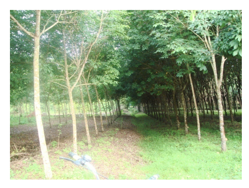
Figure 3. A rubber plantation

This community has a primary school and a religious school. Most parents in this community want their children to have a high level of education so they would have a good opportunity for employment. All men and women in the community can speak Thai.