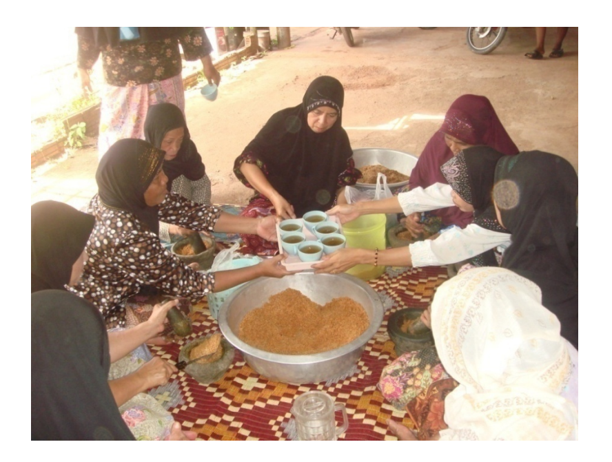
Figure 10. Sweet tea