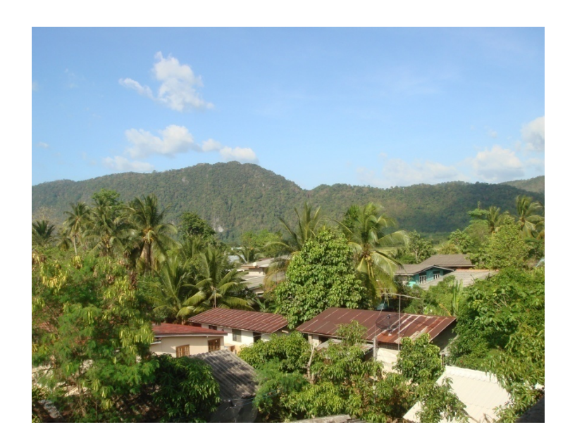
Figure 1. Plain foothillsgeography