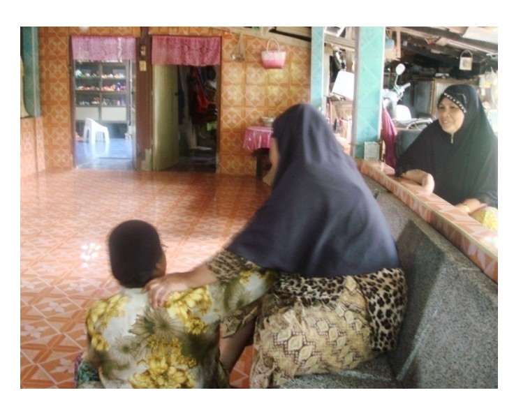
Figure 13. Massage by folk healers

"The first time when I went to see a massage folk healer, the healer compared my legs and told me that there was an imbalance of temperature (hot and cold) in my legs. He massaged me for 3 days by using a balm. He also treated the ligaments making them better." (K4)