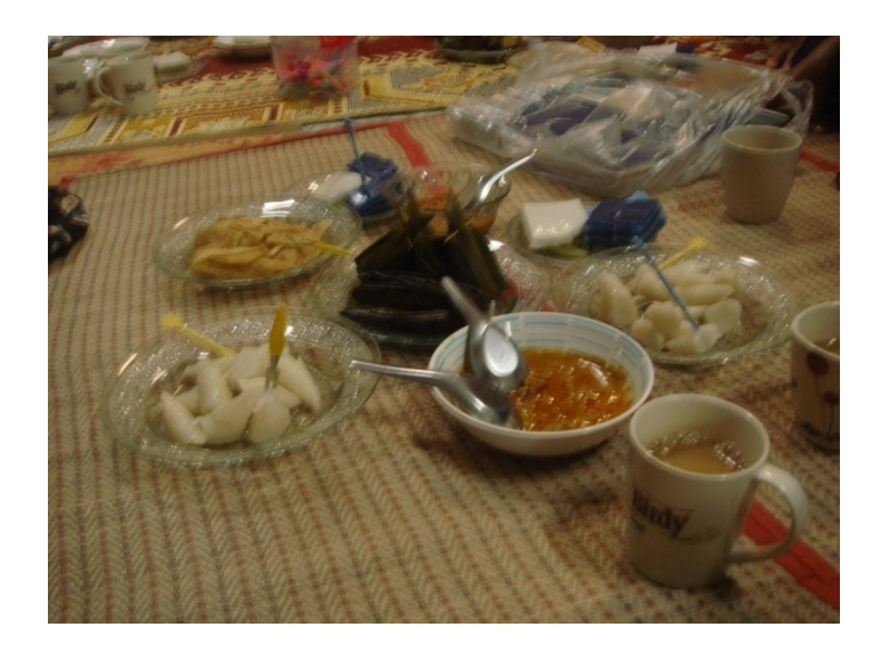
Figure 9. Sweet and Oily foods in everyday life

"...I have to have many foods at every banquet because I don't know what to eat. Everything is very fatty. I always have a headache after a meal because of high blood pressure" (K5)