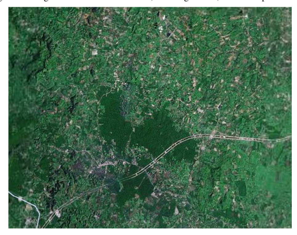
Figure 2. Saeng Sawan Oil Palm Plantation, Prasaeng district, Suratthani province