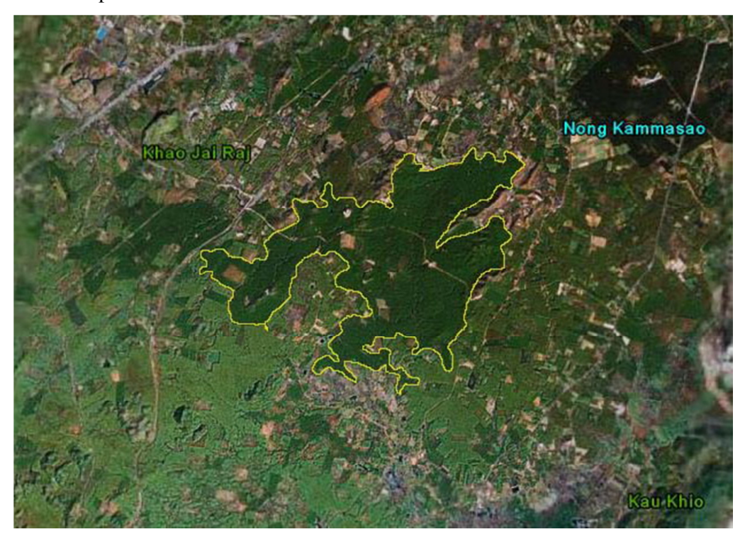
Figure 3. Chumphon Industry Oil Palm Plantation, Pratiew district, Chumphon province