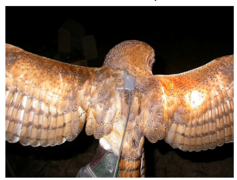
Figure 1. The transmitters were attached to the bird by harness of rubber tube