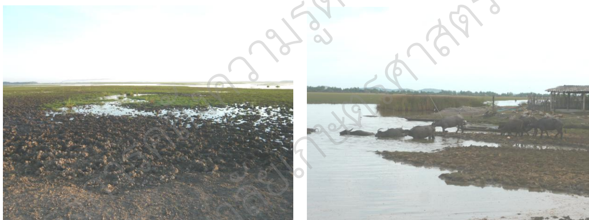
Figure 2 The environment nearby Songkhla Lake.

animals were reared nearby and in Songkhla Lake. In the morning most domestic animals including cattle, buffaloes and goats were grazed in the field nearby the lake (fig 2), and at night, cows and buffaloes came back into the pens by themselves. The animals lived, fed, defecated and slept nearby Songkhla Lake. The feces contaminated with parasitic eggs dropped on the ground or into the water in the lake. The parasites were spread around the lake by the flowing of water (Patz et al. , 2000). Then, the lake was the reservoir of parasite. Humans lived nearby Songkhla Lake which ate vegetable from the lake and the domestic animals could graze water plants nearby the lake, which were a potential risk to the infection of helminthic parasites including Fasciola gigantica . Cattle and humans nearby Songkhla Lake areas had many risk factors for Fasciola infection such as fresh water snails and water plants (Claxton et al. , 1997). The environment of Songkhla Lake, where was large lake and had water all the year round, promoted proliferation and spreading of fresh snails and water plants. The fresh water snails and water plants had importance for the transmission of liver flukes.