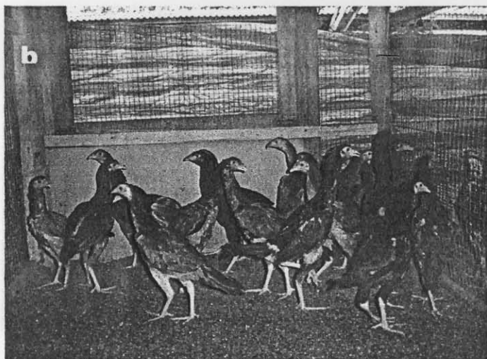
Figure 2 Intensive production system where chickens were kept in house and provided concentrated feeds; (a) outside of chicken's house and (b) inside of chicken's house which divided into 12 blocks (23 chickens/block)