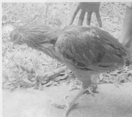
Red brown shoulder and body feather