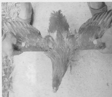
Red brown with some gray color wing feathers