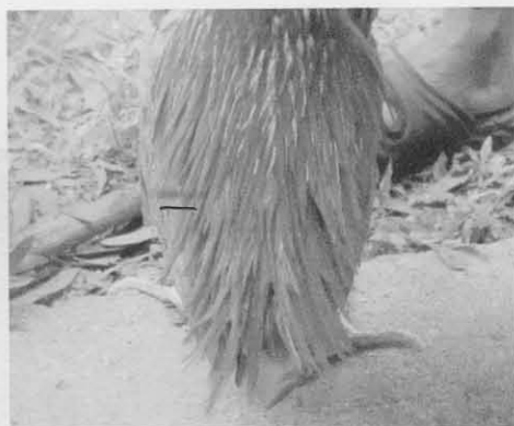
Red brown with some white sickles