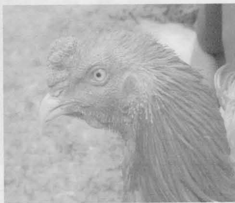
Red brown hackles and red face