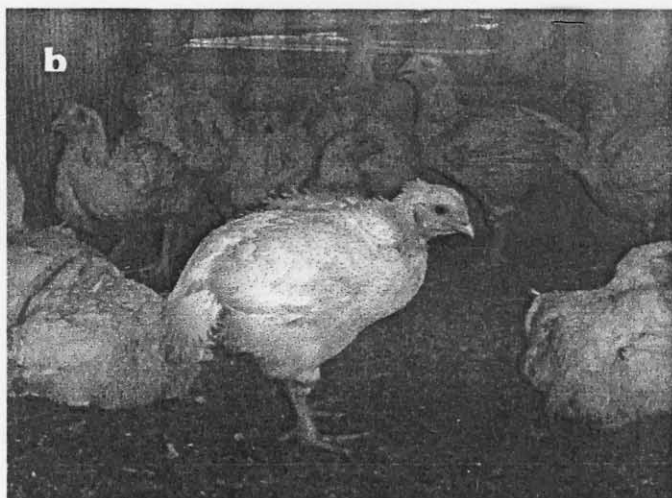
Figure 4 Broiler production system where chickens were kept in house and provided concentrated feeds; (a) outside of chicken's house and (b) inside of chicken's house which divided into 12 blocks (25 chickens/block)