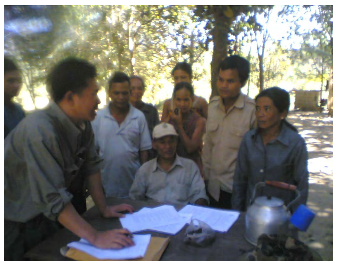
Interview questionnaires with the representative of local community (commune council committee, heads or deputy heads of villages, village rangers local community with tourism involvement)