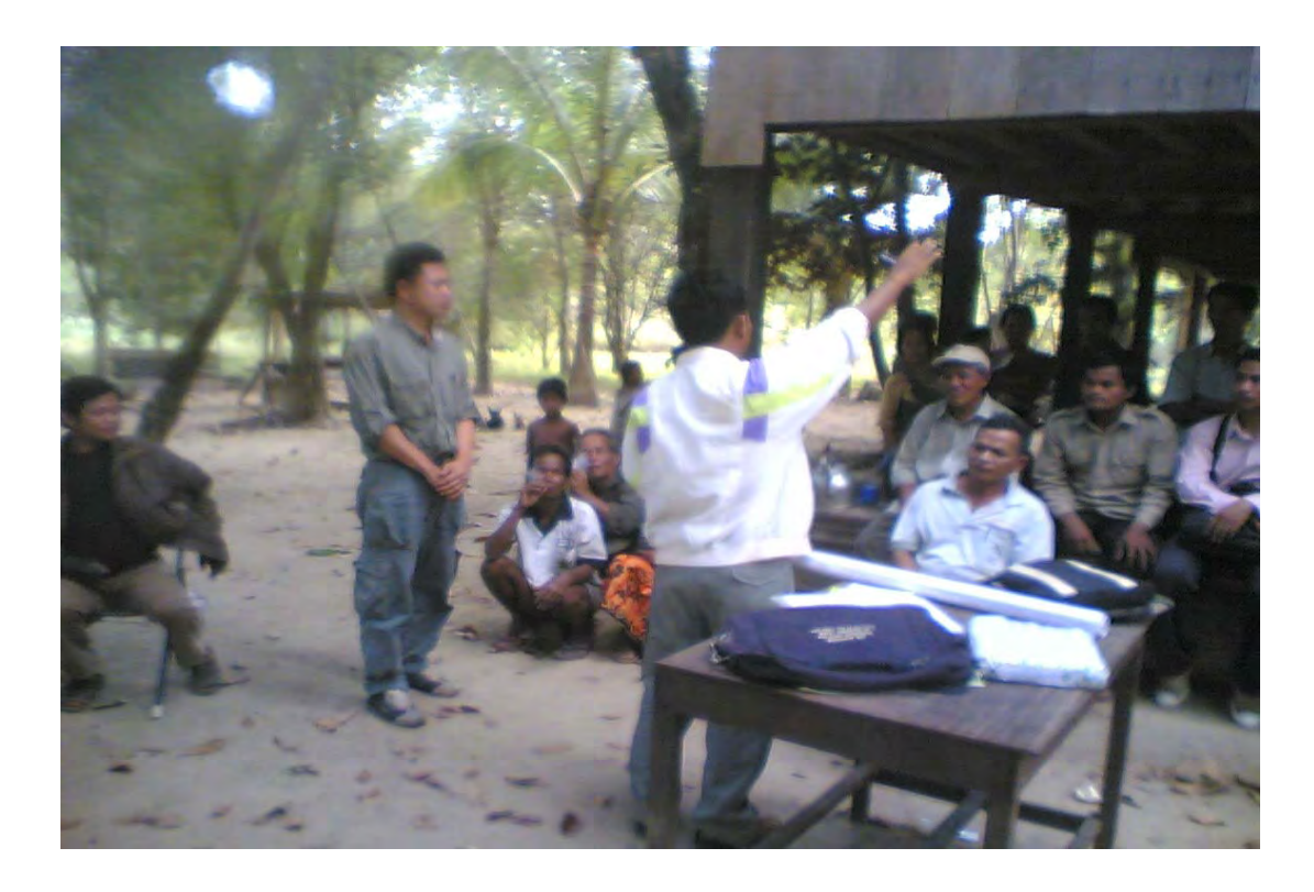
Interview questionnaires with international visitors to the park during on-site observation