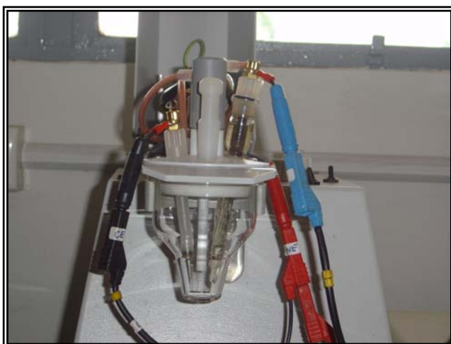
Figure 12 The three electrode system in the electrochemical cell