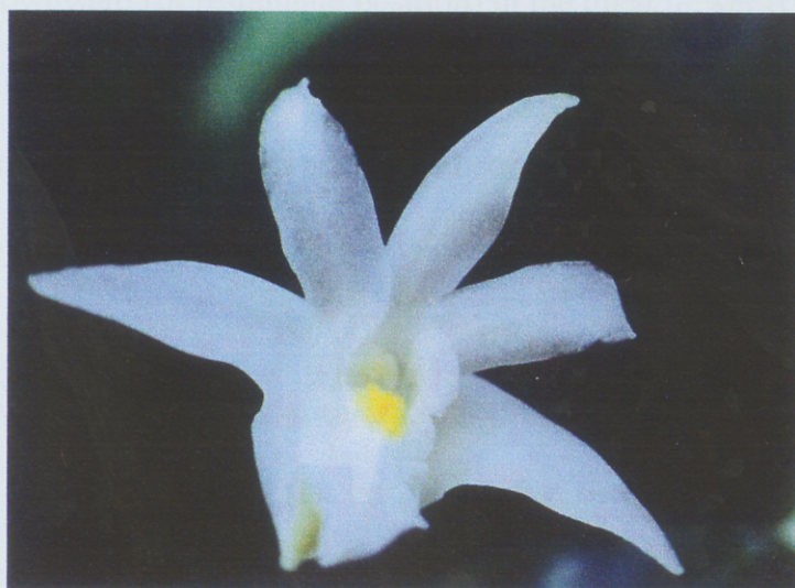
Figure 2 Flowers of D. crumenatum Sw. orchid show opened flowers (A) with pure glittering white and the lip has a bright yellow disc (B).