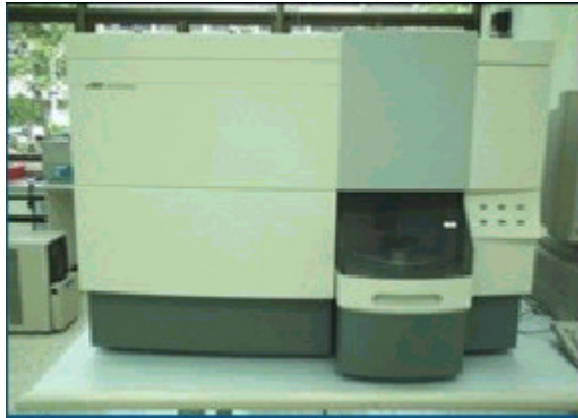
Figure 2.7 FACSCalibur in Prince of Songkla University

was operated by the Scientific Equipment Center of Prince of Songkla University, Thailand.