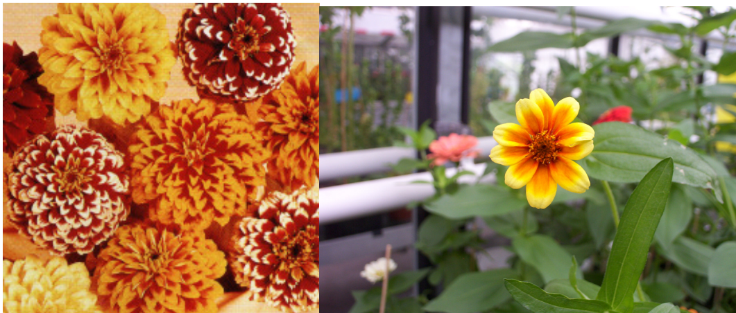
Figure 2.3 Z. haageana cv. 'Persian carpet' and cv. 'Chippendale daisy'