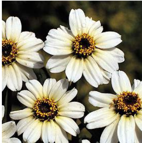
Figure 2.2 Z. angustifolia cv. 'Starbright'