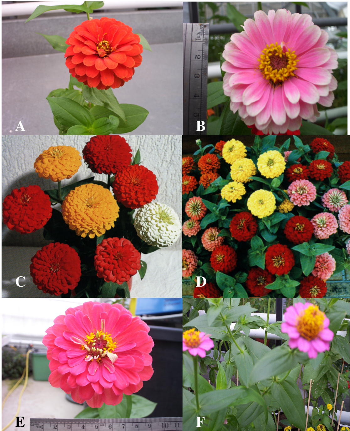
Figure 2.6 Z. elegans cv. 'Border beauty' (A), cv. 'Candy cane' (B), cv. 'Jungle' (C), cv. 'Dahlia' (D), cv. 'Giant' (E) and cv. 'Gold medal' (F)