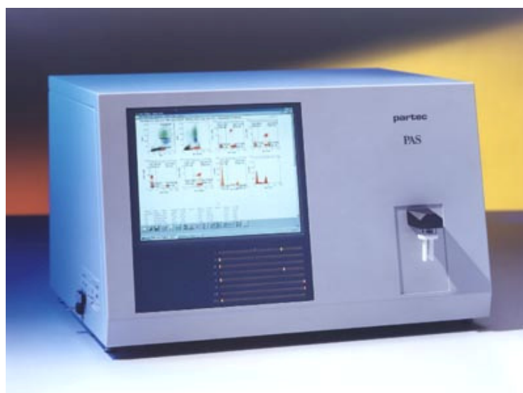
Figure 2.8 Partec PAS in The State Research Center Geisenheim, Germany

Partec PAS is an equipment from PARTEC, Münster, Germany. It has an argon ion laser and HBO lamp / 25mW 635nm laser diode to study both DAPI and PI fluorescence (see Appendix). For this research, it was provided by the Botany Department of The State Research Center Geisenheim, Germany (Figure 2.8)