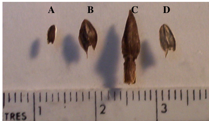
Figure 2.1 The seed size of Z. angustifolia cv. 'Starbright' (A), Z. haageana cv. 'Persian carpet' (B), Z. elegans cv. 'Dreamland' (C) and Z. elegans cv. 'Profusion'(D).

Sixteen cultivars of Zinnia spp. including Z. angustifolia cv. 'Starbright', Z. haageana cv. 'Persian carpet', cv. 'Chippendale daisy', Z. elegans cv. 'Short stuff', cv. 'Dreamland', cv. 'Jupiter', cv. 'Border beauty', cv. 'Peter pan', cv. 'Dahlia', cv. 'Candy cane', cv. 'Jungle', cv. 'Giant', cv. 'Gold medal', cv. 'Piccolo', cv. 'Sinnita' and a hybrid ( Z. elegans x Z. angustifolia ) cv. 'Profusion' were used as plant materials in this studied. Seed of Zinnia spp. were taken from the AFM Flower Seed & Agriculture Co. Ltd. Seed size are shown in Figure 2.1 and picture of all cultivars have shown in Table 2.1 and Figure 2.2 - 2.6