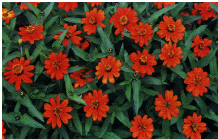
Figure 2.4 Z. elegans cv. 'Profusion'