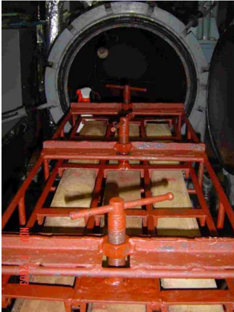
Figure E-10 Clamped rack inside the chamber.