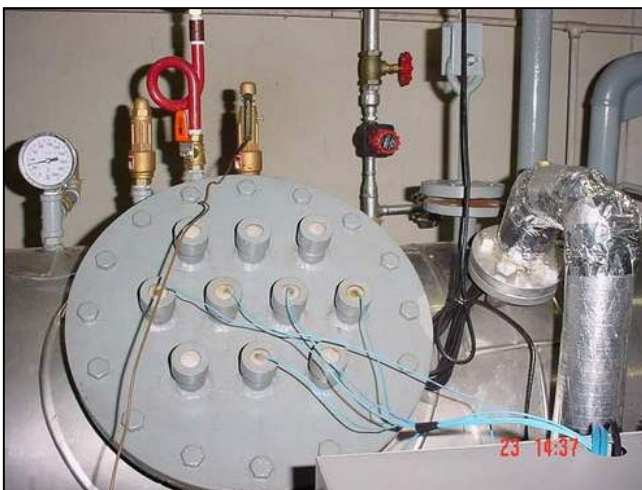
Figure E-3 Thermocouples.