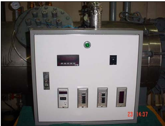
Figure E-2 Control box.