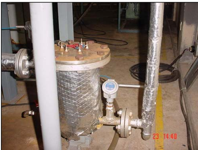
Figure E-8 Heat exchanger.