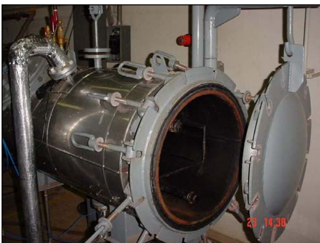
Figure E-9 Vessel cap.