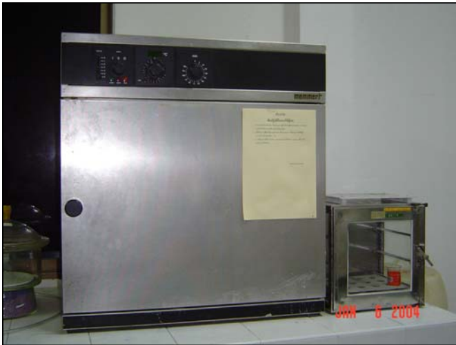
Figure E-13 Oven.