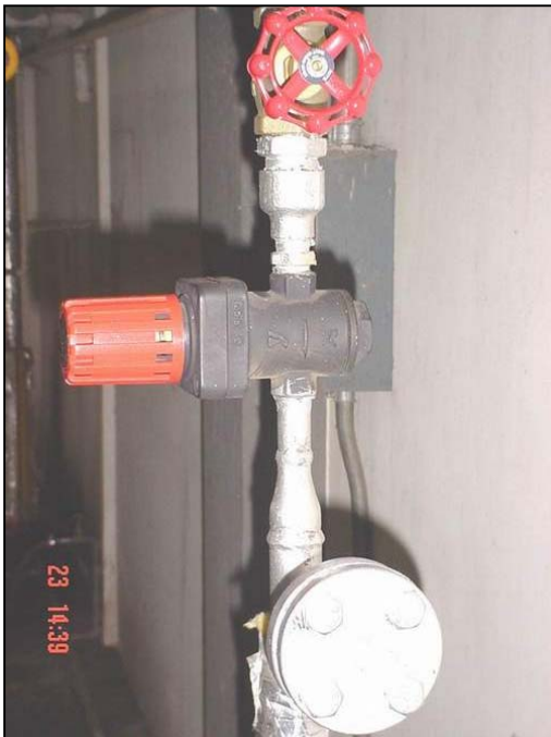
Figure E-7 Reducing valve.