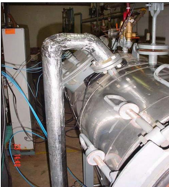
Figure E-6 Steam pipelines (top).