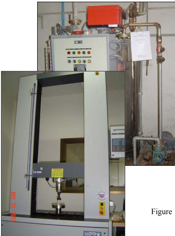
Figure E-11 Vertical steam boiler.