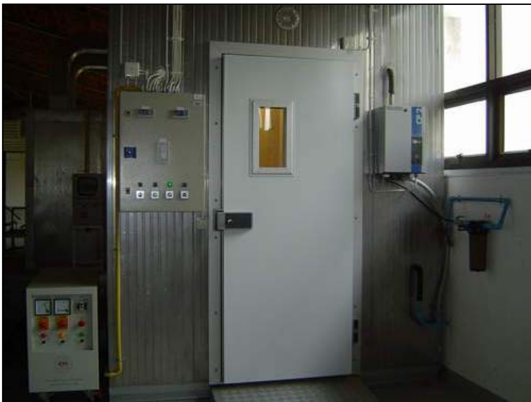
Figure E-14 Weather conditioning chamber.