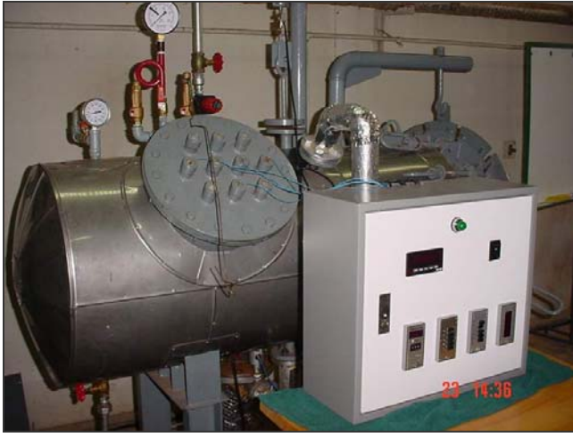
Figure E-1 Drying Vessel.