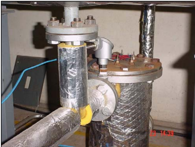
Figure E-5 Steam pipelines (bottom).