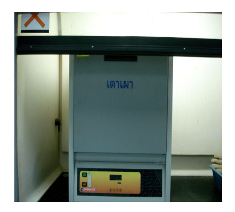
Figure 2-5 Dry ashing