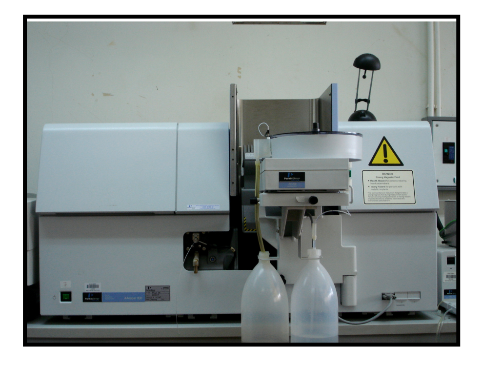
Figure 2-1 Atomic absorption spectrometer (Perkin Elmer AAnalyst 800 with Zeeman Effect background correction)