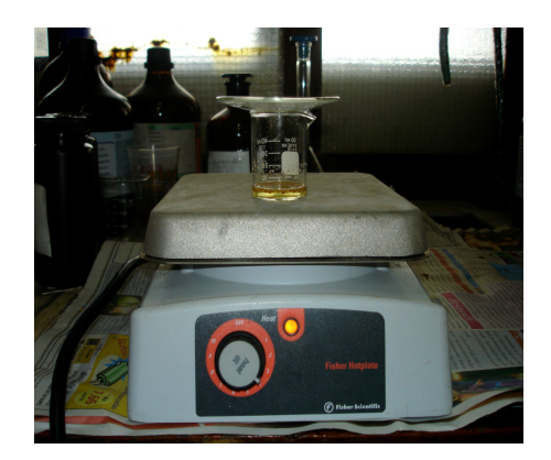
Figure 2-3 Hot plate digestion

Certified reference material (DORM-2) 0.2 g (dry weight) was accurately weighted into beaker and 5.0 mL of concentrated nitric acid was added. The beaker was covered using watch glass and heated on the hot plate at 65 ^{\circ} C for 8 h. to obtain the clear solution and then diluted to 25.0 mL with de-ionized water. The pH of sample solution was adjusted to 6.0 using 0.1 M ammonium hydroxide. The procedure in section 2.4.1 was repeated (Acar, 2001). The hot plate digestion method is shown in Figure 2-3.