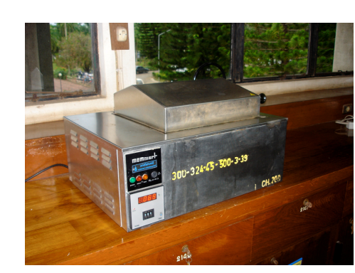
Figure 2-4 Water bath digestion