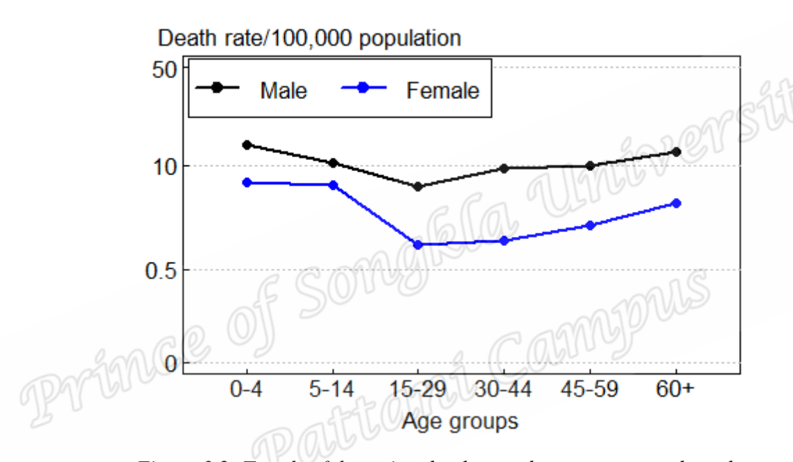
Figure 3.2: Trends of drowning death rates by age group and gender

Figure 3.2 shows the trend of drowning death rates by age group. Drowning death rates in males were consistently higher than those in females across all age groups. Drowning death rates had a peak in age group 0-4 years. A decreasing trend from age group 0-4 to 15-29 years was found in both genders and a slightly increasing trend for both genders occurred after age group 15-29 years until age group 60 years and over.