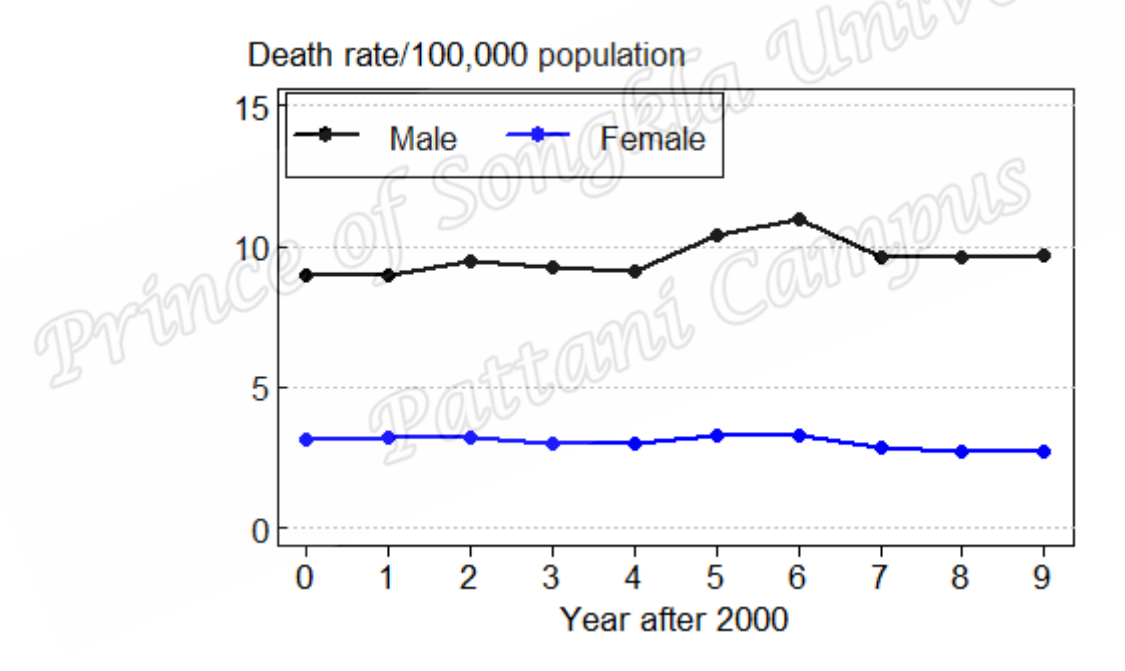
Figure 3.1: Annual drowning death rates by gender

Figure 3.1 shows drowning death rates by year and gender. Males had slightly increasing trends of drowning death rate whereas a decreasing trend appeared in females. Drowning death rate per 100,000 population was highest in year 2006 with 10.97 and 3.29 for males and females respectively. Males had approximately 3 times higher death trend than females.